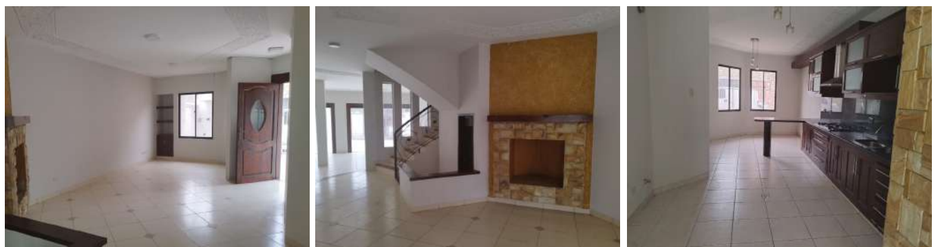
The beautiful and spacious new transition home has three floors with 3 bedrooms, 5 bathrooms, a loft where up to 5 people could sleep and a back patio with a grill and laundry space. Left: Living room and front door. Center: Living room fireplace and hallway. Right: Kitchen