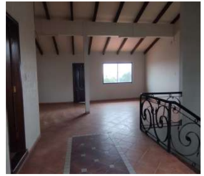
Left: Back patio Center: Staircase Right: Loft space