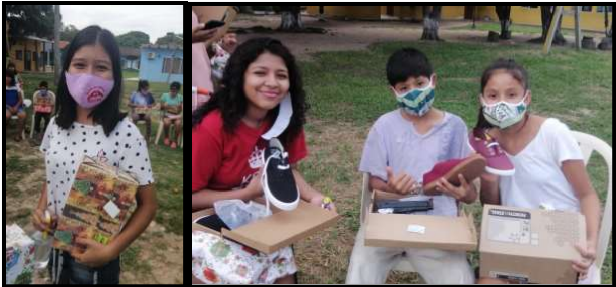
Shoes for all of the children from a local donor