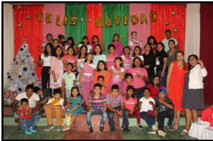
Thank you for making Christmas 2020 so special for our children!!!

In spite of several milder but longer lasting Covid-19 cases among HOHB staff during the holidays that affected some end-of-the-year activities, the children enjoyed a prosperous holiday season with generous gifts from their sponsors and several visits from local contacts who provided things like special snacks, shoes, toys and even a new oven.