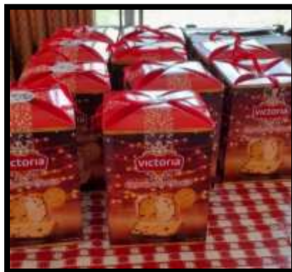
Fruitcake is a special holiday treat in Bolivian tradition – like Christmas cookies in the USA.