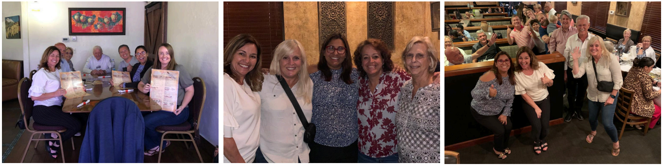
Left to right: More generous provisions, connections and brain-storming moments over delicious meals and with even better company – our Family of Hope in Fort Myers.