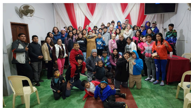
Left: The group poses with the staff. Right: HOHB and the group say “until we meet again!”

The completion of the boys’ dorm opened plenty of room to spread out! One of the workshops in the boys dorm was accommodated as a spacious sewing workshop – complete with recently donated, brand new machines for the sewing program. The children have been practicing in their workshop classes and are even selling totes for an upcoming conference in Bolivia.