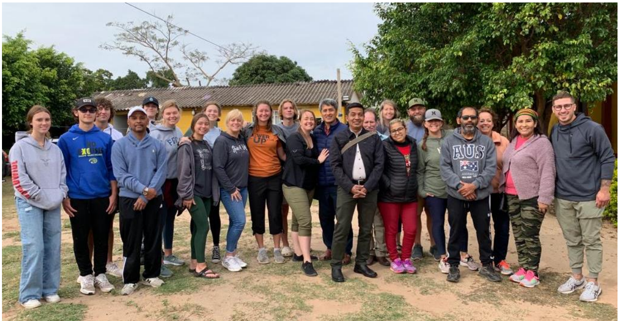
The entire team pitched in to help load the truck to move the girls back to HOHB campus after a temporary stay at the Jada Biblical Seminary.