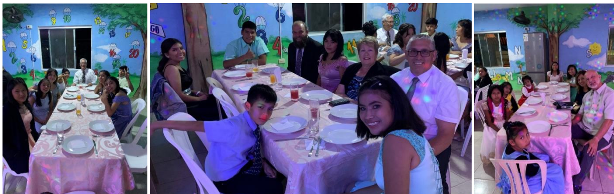
Sponsors and children enjoyed spending time together over a special dinner.