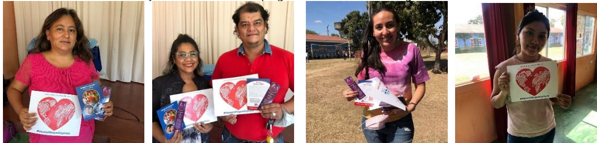
Local visitors are encouraged to become child sponsors.