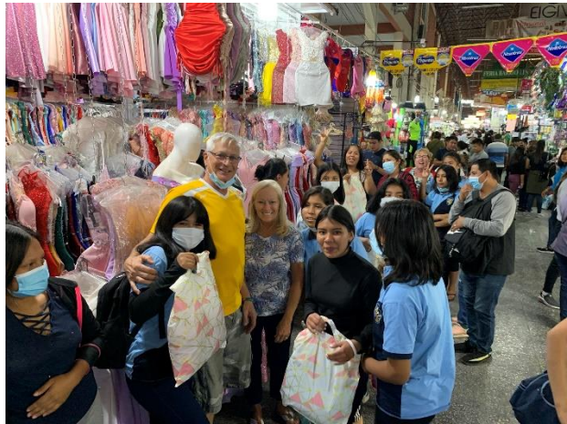
Sponsors took the children shopping for gala clothes to prepare for the "Princes and Princesses of God Event" – a sponsor-funded, formal dinner designed to be a palpable reminder of our royal identity as children of the King.