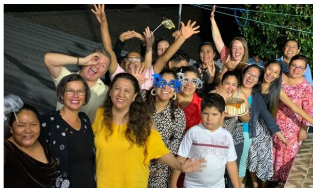
A group photo and juna foto local!

August 27 th was Graduation Day for the 16 people who completed the course – up 2 from the 14 that originally started. They were the first cohort of students to complete Haven of Hope International's Trauma Informed Care Certification Program and the first group of students in Bolivia to complete Texas Christian University's TBRI (Trust-Based Relational Intervention) Course.