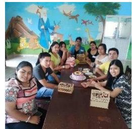
Some of the children received visits from family members on their birthdays.