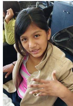
Our generous sponsors also provided the girls with a full salon experience – hair and nails – to prepare for the "Princes and Princesses of God Event". For most of our girls, this was their first salon experience ever.