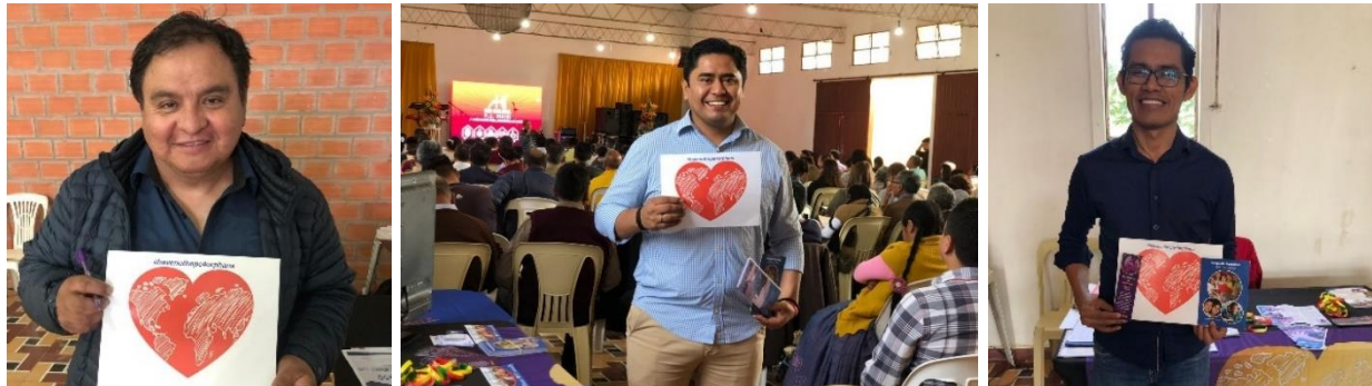
Bolivian pastors pose with the Hope Heart at the National Pastor's Seminar.

The Church of God National Pastoral Seminar provided the perfect opportunity to spread awareness and solicit local support for the Nation of Orphans.