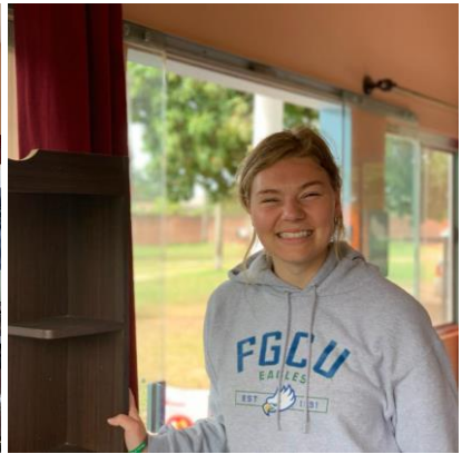
Back on campus, Riverside's Student Ministry helped unload the truck and carry furniture and other belongings back to where they belong. Left: The youth are almost done emptying the moving truck. Center: The team continues strong after a morning of moving. Right: Raeghan poses after helping move furniture.