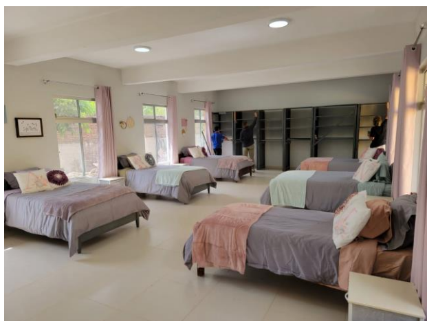
The dorm rooms look amazing and are ready for the grand "welcome home" ceremony!