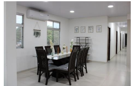
A sneak peak of the shared living spaces in Emma's Echo Internship Building. More details following the official inauguration in October!

Then, Angela Bryan arrived to conclude HOHI's Trauma Informed Care Certification training. The final presentations were beyond expectations – from volunteers to the maintenance man to the educators to the professional team, everyone did an outstanding job explaining the heart of trauma care from their own unique perspective.