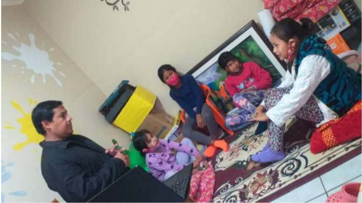
Recent workshops with the youngest group of girls (above) and the youngest group of boys (below)

Our psychologist prepares activities to help our children work through difficult situations that arise in their lives and learn important interpersonal relationship skills they will need for healthy social interactions.