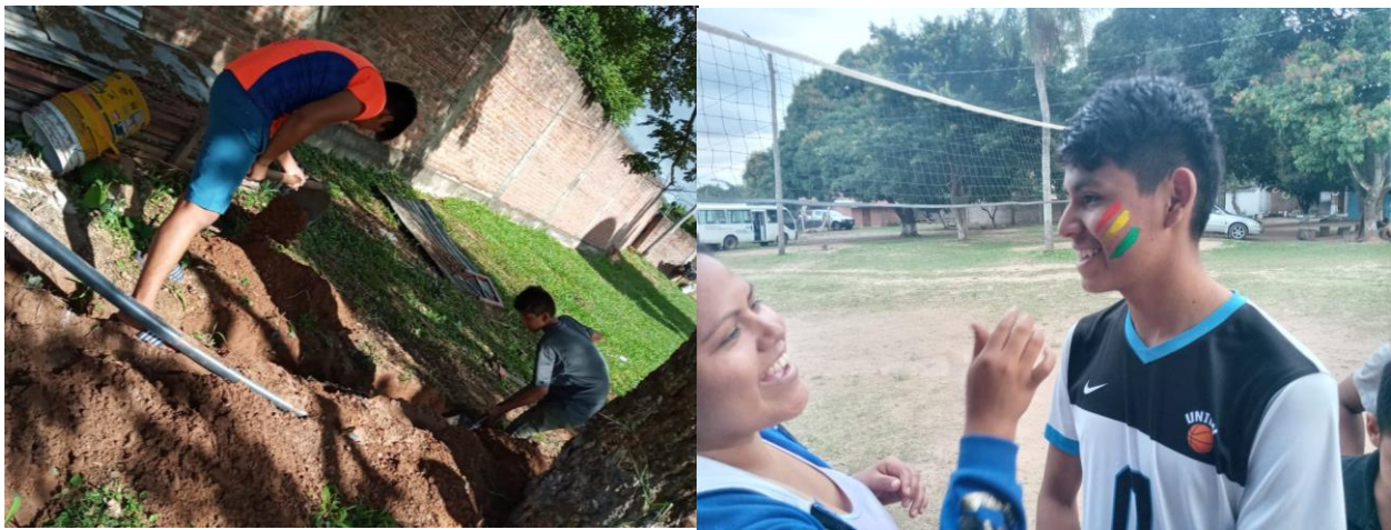
They help with projects around campus, but also take time to watch the Cup of the Americas soccer championships...