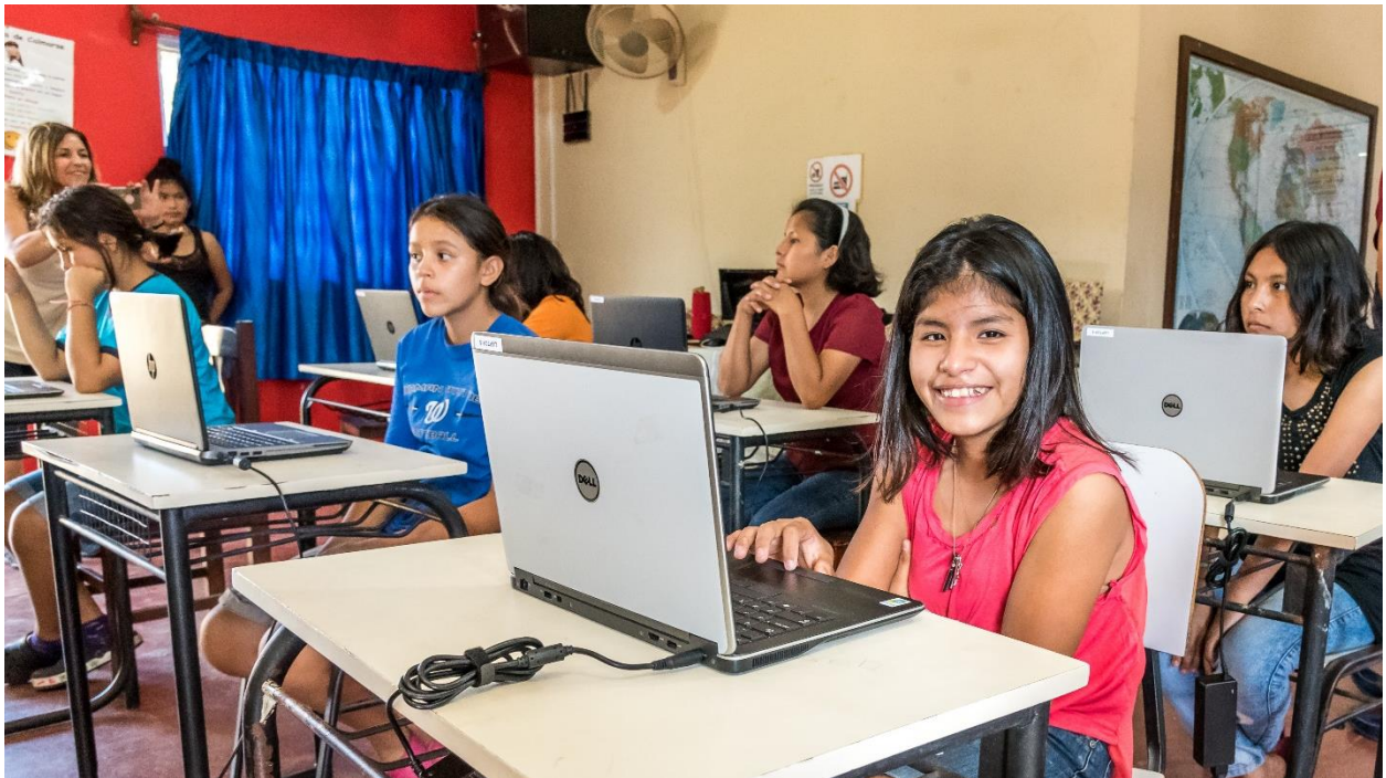
The children receive the laptops that the team brought to ensure that every grade level has a quality device for virtual classes.