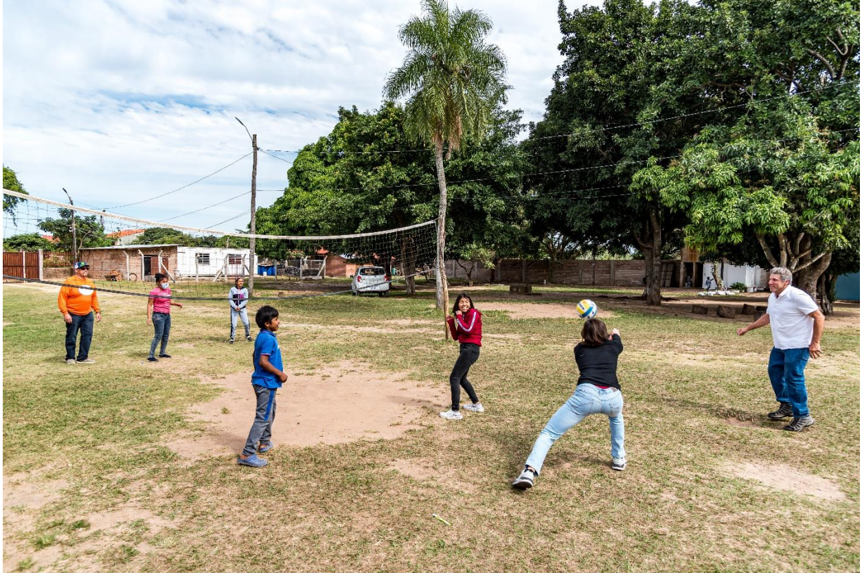
The team spends quality time playing with the children.