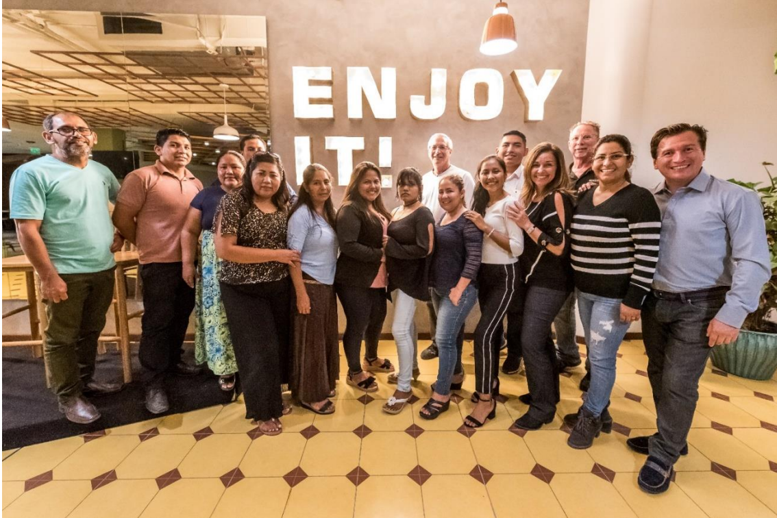
The staff enjoyed a relaxing evening with the Haven of Hope International team – a much deserved break!