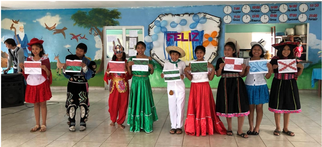
During the talent show, this group of children showcased the typical songs, dress and flags of the 9 departments, or states, of Bolivia.