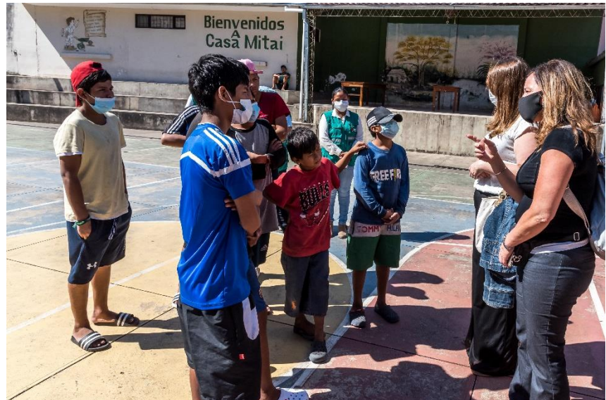
The team visits the Santa Cruz Departmental Government's Social Policies Offices (left) and a day center for street children called "Casa Mitai" (right).