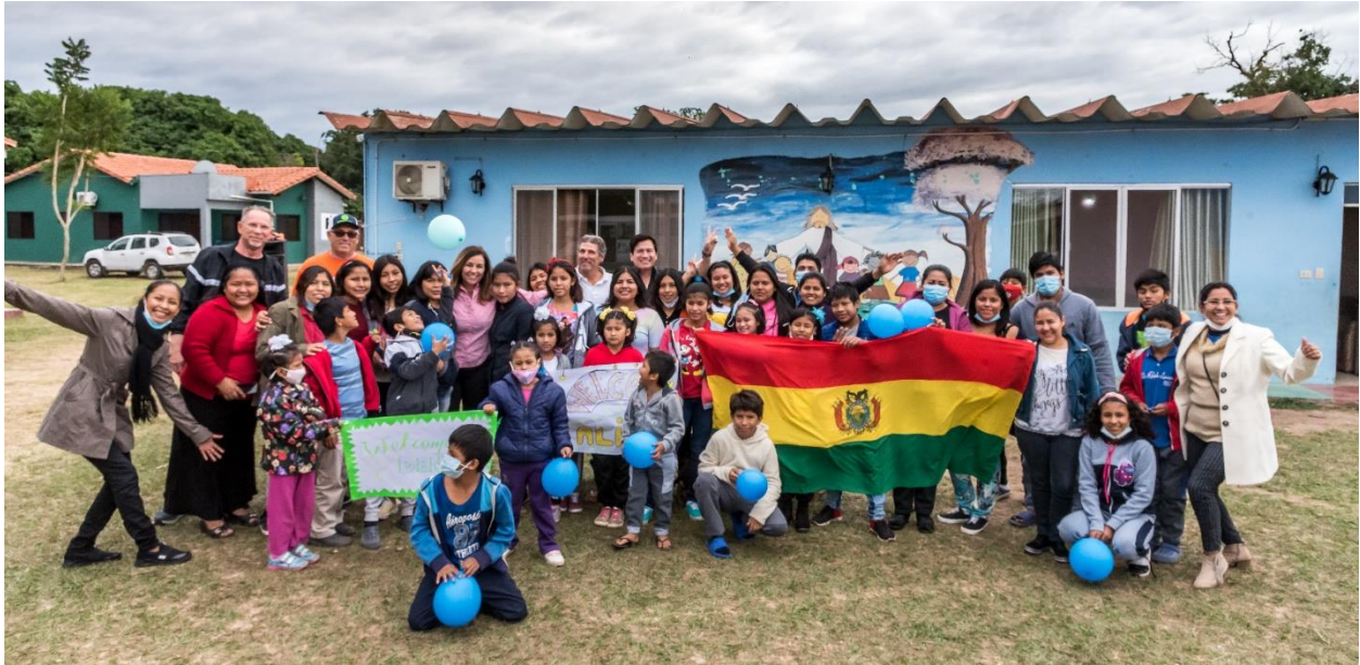
Children and staff welcome the group with banners and the Bolivian flag.