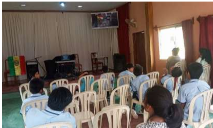
First Day of Classes