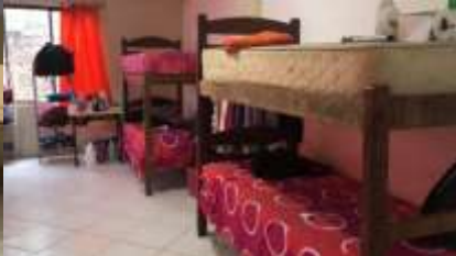
Looking good! Two perspectives of the dining hall/study room and the room our older boys will stay in.