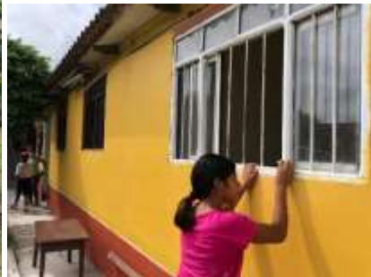
Staff and children hard at work – Painting the gate and cleaning up – Anachely works on window frames