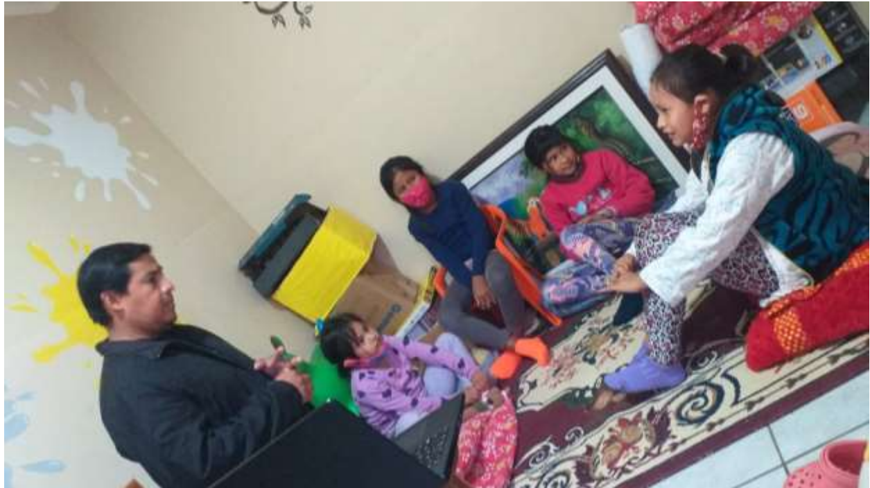
Recent workshops with the youngest group of girls (above) and the youngest group of boys (below)

Our psychologist prepares activities to help our children work through difficult situations that arise in their lives and learn important interpersonal relationship skills they will need for healthy social interactions.