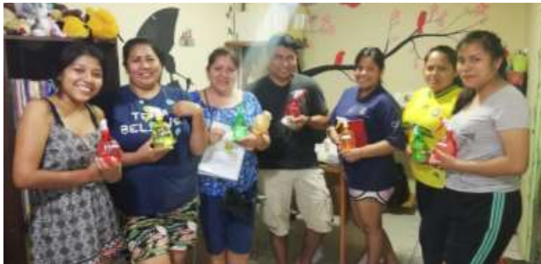
Biweekly educator meetings