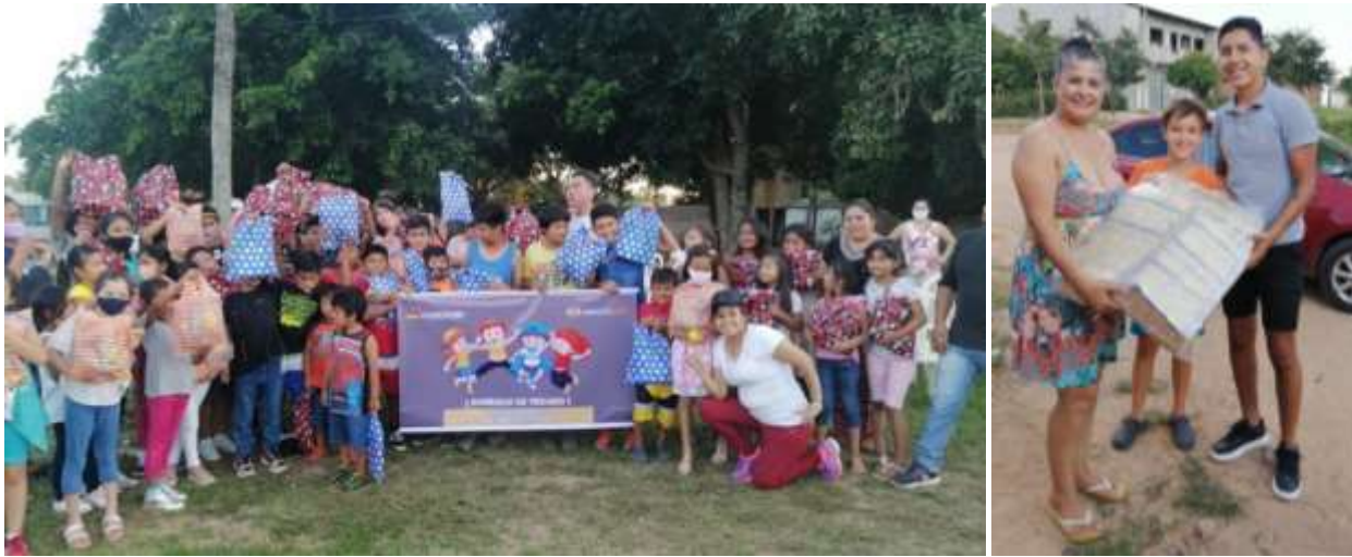
Left: The Church of God in Bolivia's Sunday School network provided a bag with school supplies for each child and an afternoon of activities. The leaders of this network have also help discipleship classes at Haven of Hope. Right: A neighbor drops off some snacks for Haven of Hope.