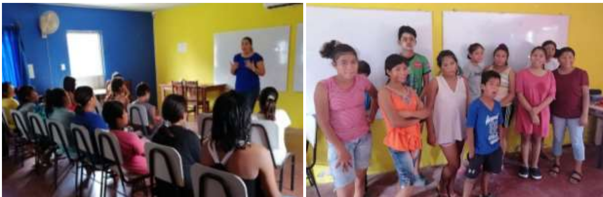
Left: A public speaking workshop by a local volunteer. Right: Another volunteer shares skin care tips.