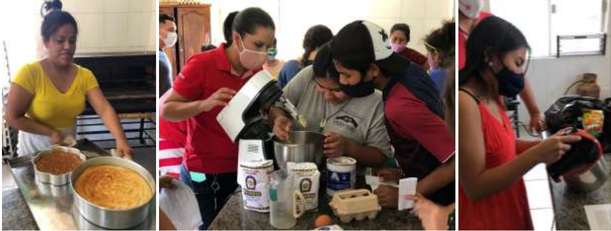
Volunteers from a local Rotaract Club taught our adolescents and youth some new baking recipes.