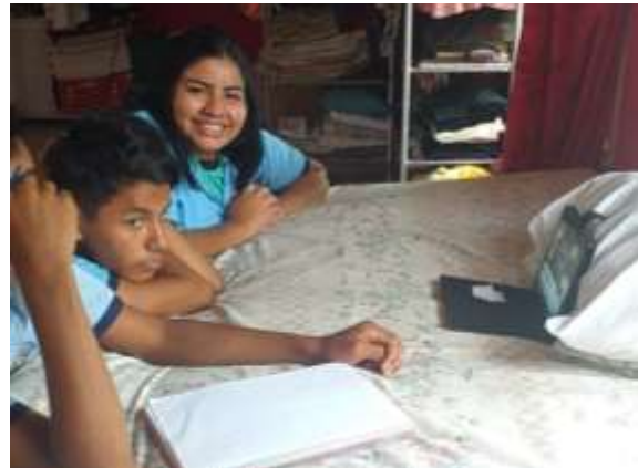
4 th graders (left) and 10 th grader (right) enter Zoom classes from different areas of the girls' dorm.