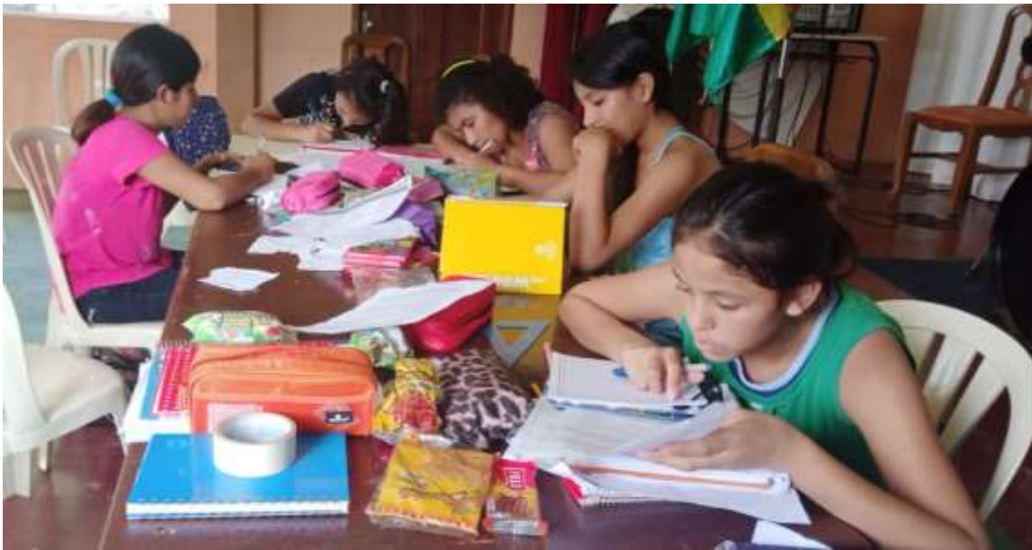
Our young ladies hard at work.