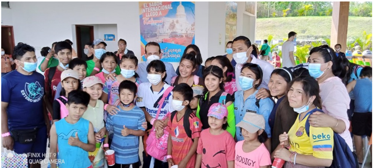
The local government also sponsored a day for swimming at a resort for orphanages. HOHB poses with Governor Camacho.