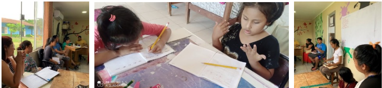
Left and Right: Staff meetings keep

HOHB's team both collaborated with volunteers and even hired some help to ensure healthy and helpful activities for summer vacation. And now that summer vacation comes to an end along with the month of January, they continue to plan in preparation for a prosperous 2022 while children start to review math, reading and writing to be ready for school. Looking forward to what lies ahead and so thankful to be walking with you on this fulfilling journey.