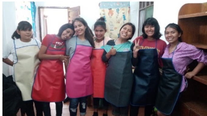
The girls display ingredients for making natural remedies for cold prevention and care during the Omicron phase of the Covid pandemic. They also model the aprons they wear while learning to cook for themselves – a valuable life skill - during summer vacation.